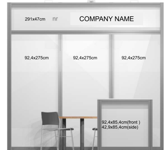
/sample of exhibitor stand/

*It is not possible to guarantee all deliverables (e.g., logo on conference bag) after August 11th, 2025 (due date).